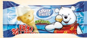
COB 604 Vanilla Cone ice cream