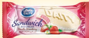
SAN 104 Vanilla Strawberry Sandwich ice cream