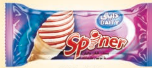
COB 607 Vanilla Cone ice cream Decorated with Marmalade