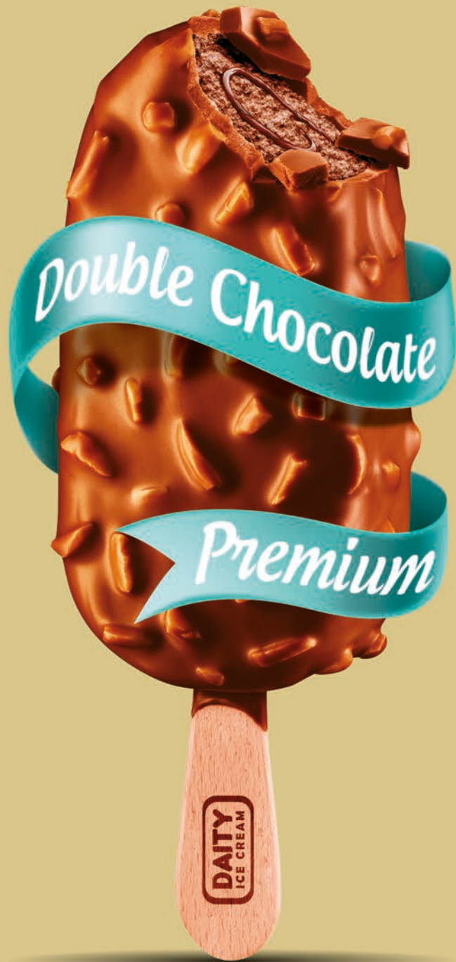
Double Chocolate Premium Ice cream