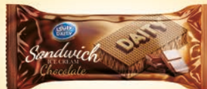
SAN 103 Cocoa Wafer ice cream