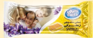
SAN 102 Saffron Wafer ice cream