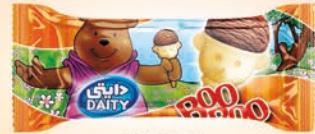
COB 605 Cocoa Cone ice cream