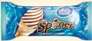
COB 606 Vanilla Cone ice cream Decorated with Chocolate