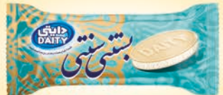
SAN 106 Traditional Vanilla Wafer ice cream