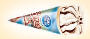
COB 607 Vanilla Cone ice cream Decorated with Chocolate